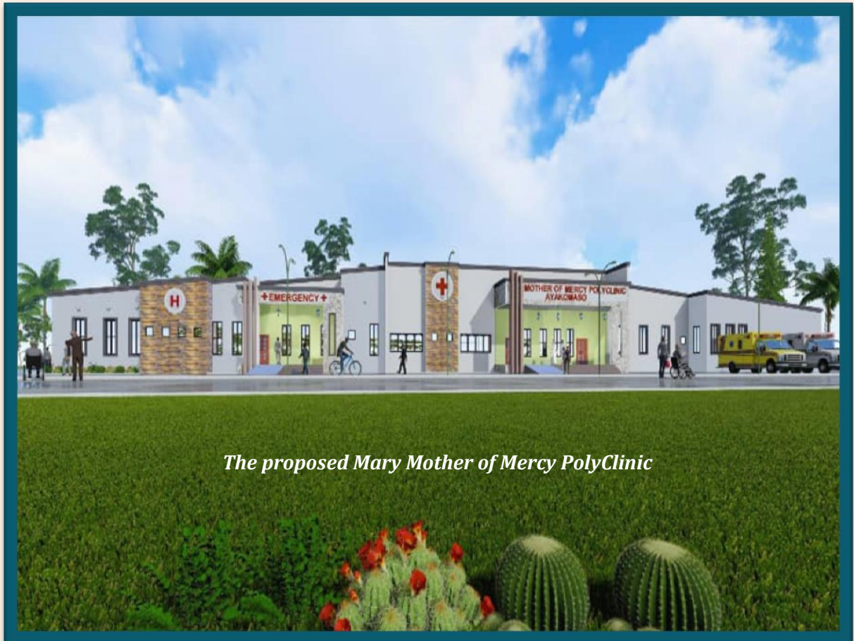
The proposed Mary Mother of Mercy PolyClinic