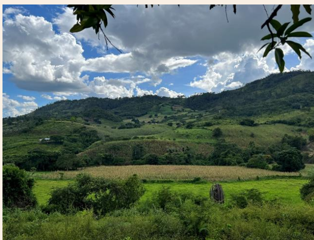
Residents work their plots and plant corn

In the municipality of Guayape, the population is 13,665 people which is made up of 6,848 men and 6,817 women. It is estimated that children represent 34.44%, adults 55.55% and the elderly 10.01%.