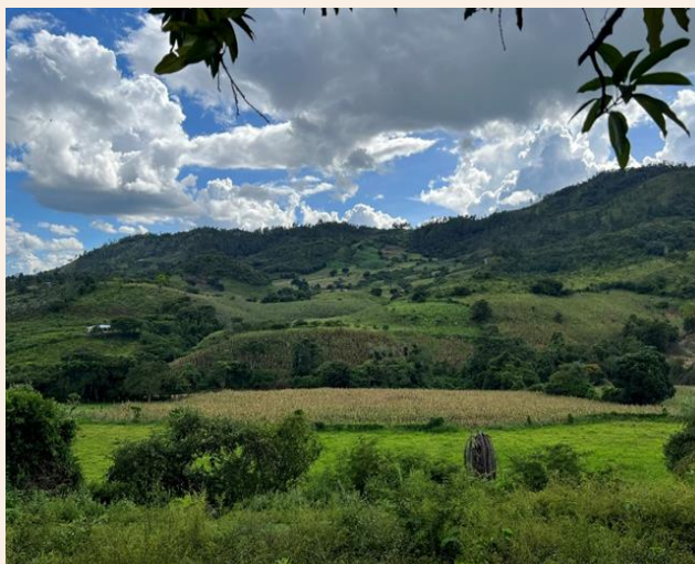
Residents work their plots and plant corn

In the municipality of Guayape, the population is 13,665 people which is made up of 6,848 men and 6,817 women. It is estimated that children represent 34.44%, adults 55.55% and the elderly 10.01%.