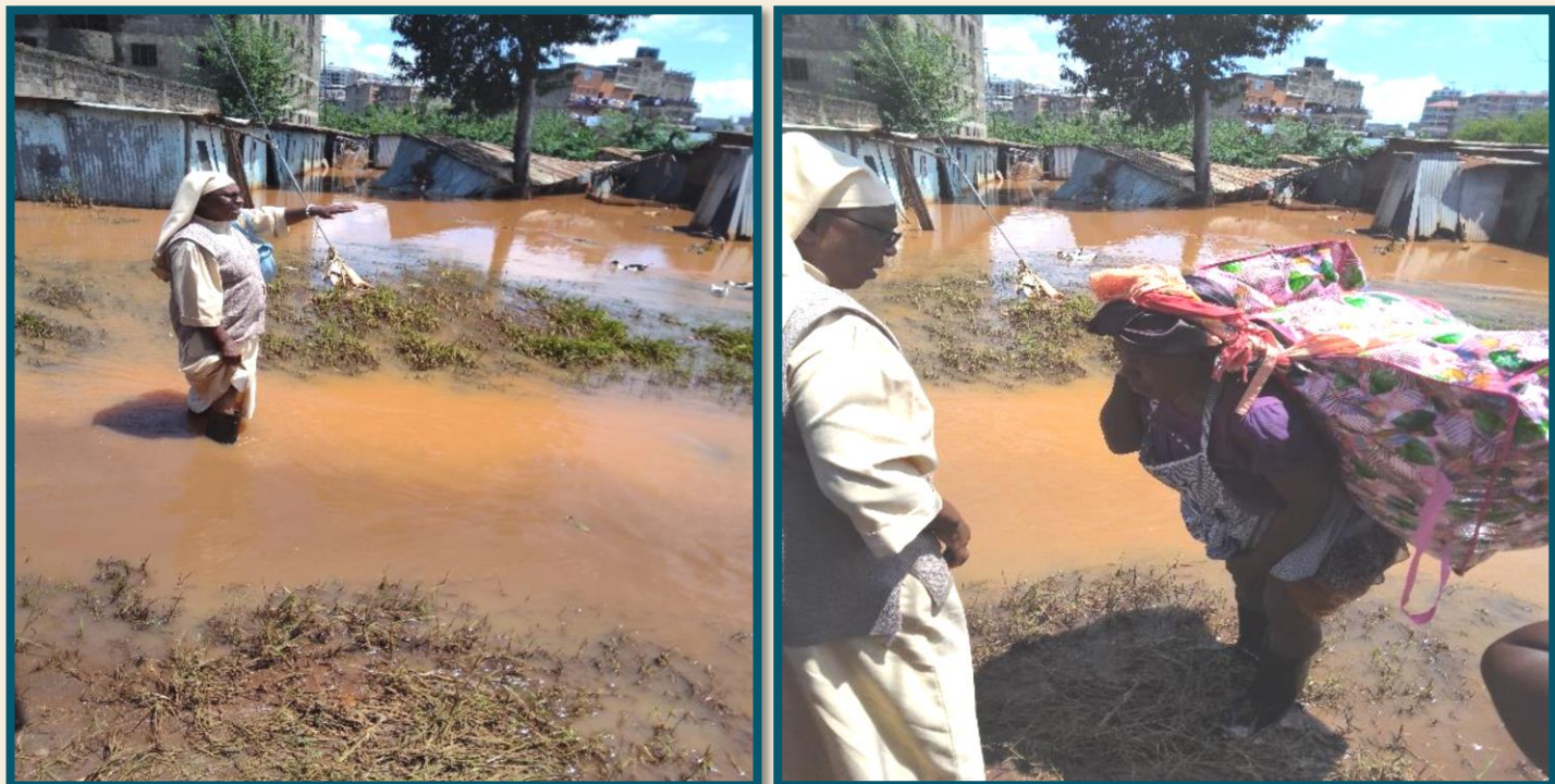
Outreach for flood victims in the Dandora slums

Together, we can help keep them safe as they reach the unreachable!