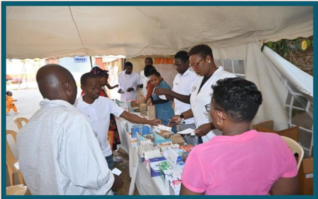
Community medical outreach camp