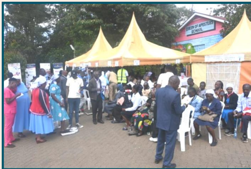
Medical outreach camp during the nationwide doctors' strike